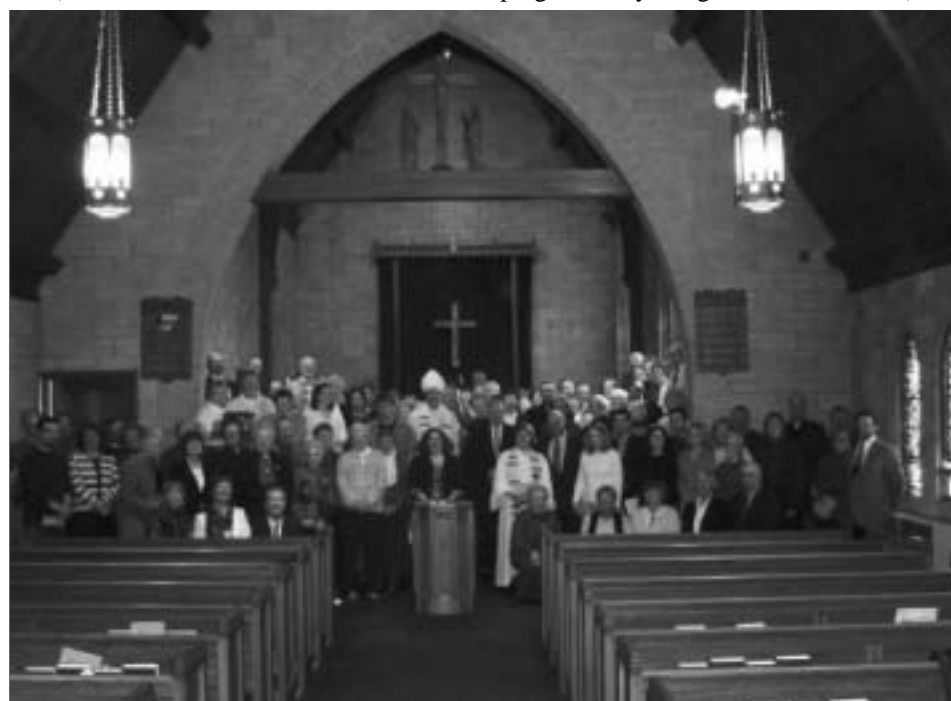
Members of Holy Trinity Church, Iron Mountain and friends gathered February 29 to reaffirm Baptismal Vows and commission 15 new members of the Ministry Support Team.