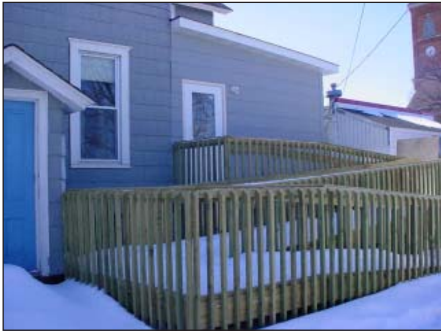
Grace Church, Menominee has nearly finished their ramp and new bathroom on the parish house. They hold worship services in the parish house in the winter, saving heating costs and allowing for a different style of worship as well.

Trinity, Houghton and Christ Church, Calumet have been sharing a soup and bread lunch each Wednesday during Lent. In addition to lunch they are reading the meditation of the day from the ERD resource "The Call of the Cross" and discussing the reflection questions.