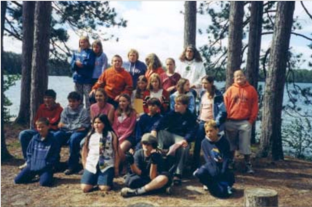
Junior Camp had 22 campers from Grade Four to Grade Eight