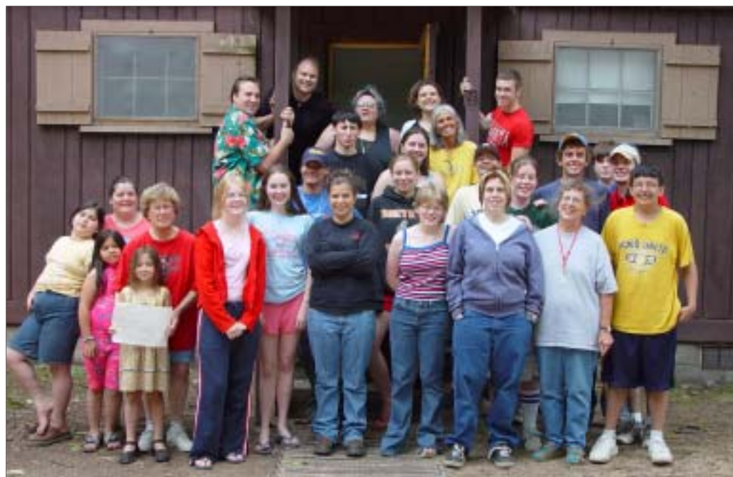
Eleven campers came to Senior Camp, smaller this year because camp included the morning of July 4th. But the fun was big!