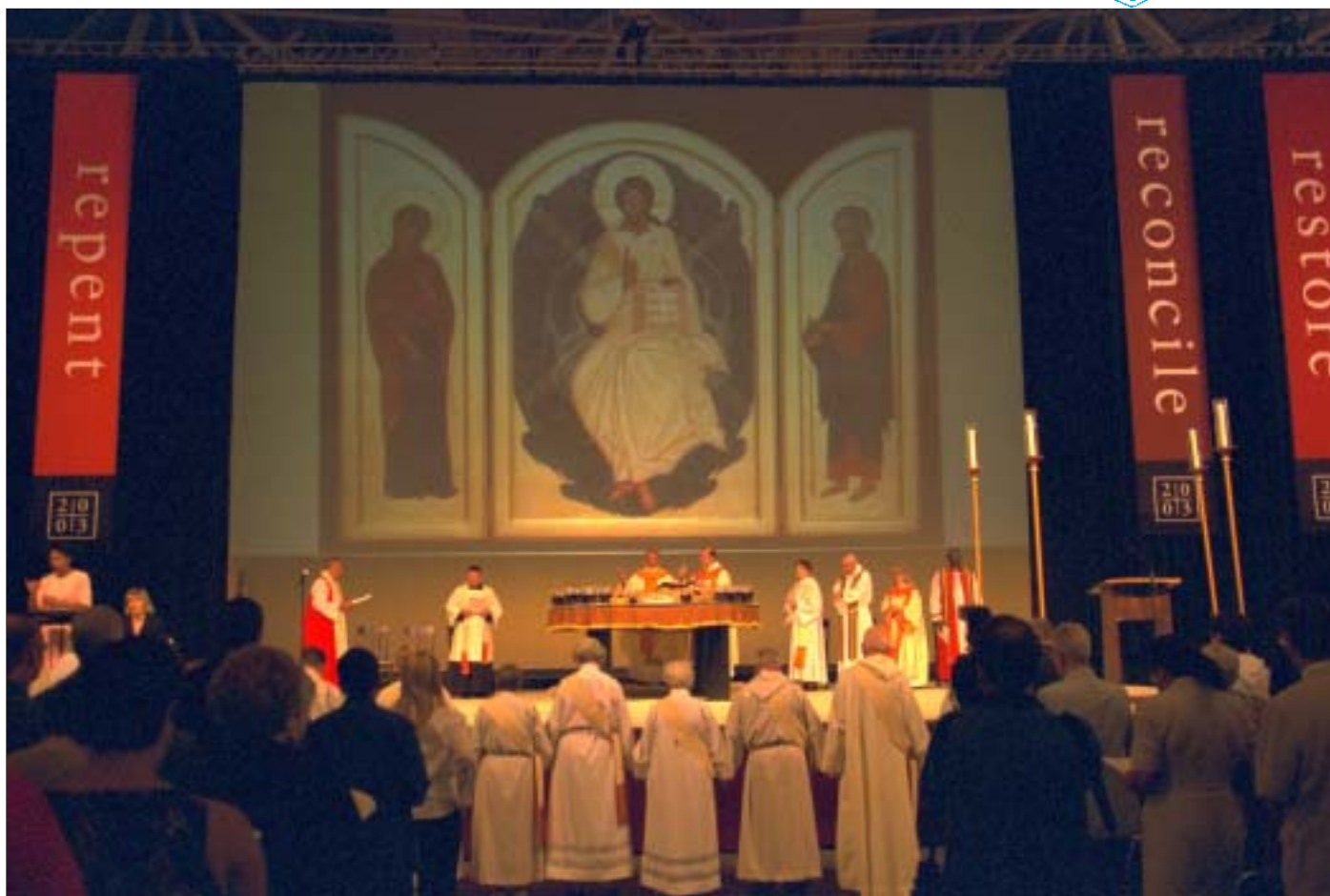
Thousands gathered for the Convention Eucharist at the Minneapolis Convention Center.

“Profound Acceptance and Deep Apprehension”