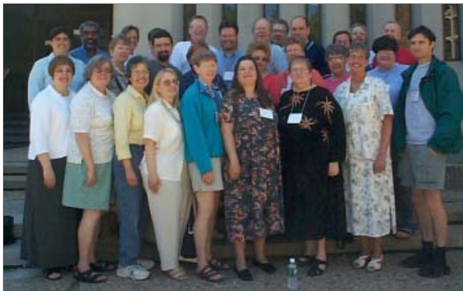
Participants in the Episcopal Divinity School/Diocese of Northern Michigan Course on Ministry Development gather for a group photo.