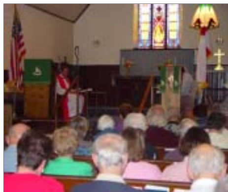
It was a standing room only crowd at the centennial celebration at St. Stephen's, DeTour Village.

It was a grand celebration, and left everyone feeling uplifted and inspired for the future, both in DeTour Village and throughout the diocese, wherever there are congregations ministering in our small towns and villages.