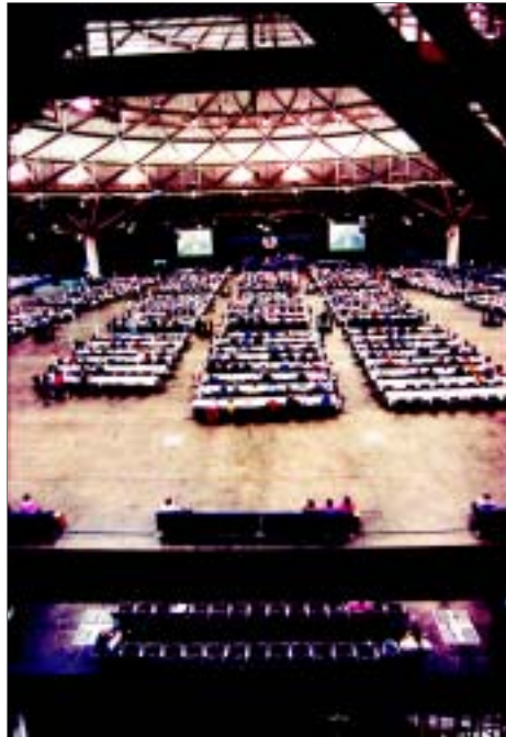
A bird's eye view of the House of Deputies during its meeting at the Minneapolis General Convention.

The Legislative Session continues until about 12:30 or 1:00pm.