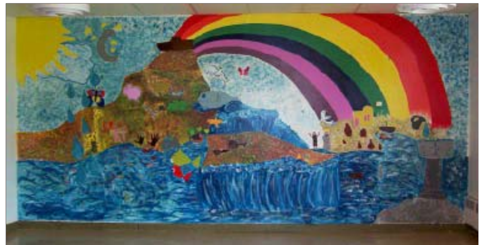
The mural in the Sunday School room at St. Stephen's, Escanaba was painted by the children throughout the past year.

Diocesan Council meets September 6 to receive the Finance Committee's recommendations and finalize the budget for presentation to Diocesan Convention in October.