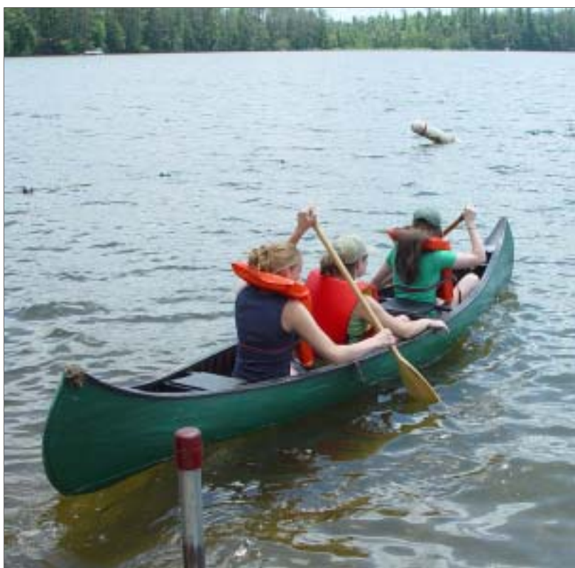
Activities included canoeing for the first time. Some days were so hot that canoeing became swimming!