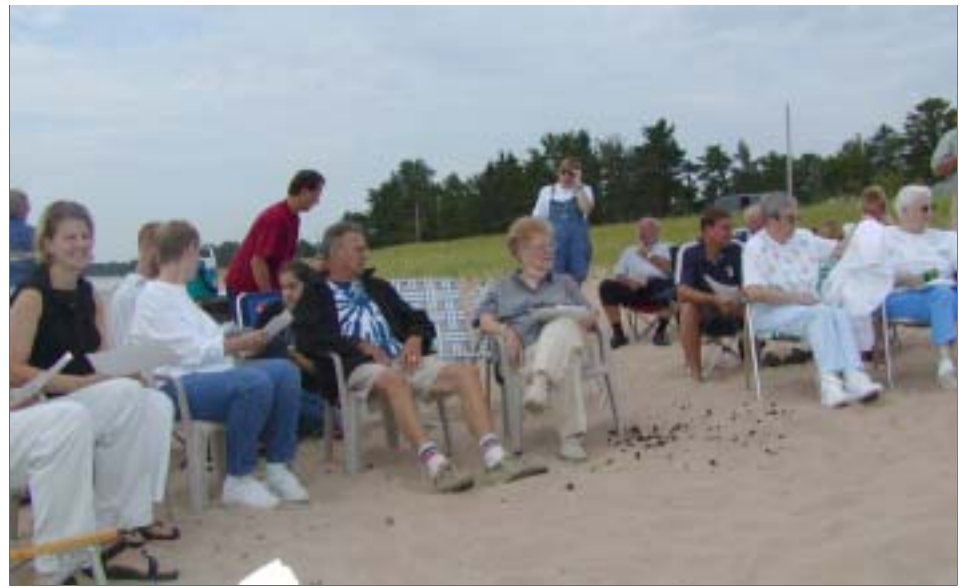
Members of Calumet and Eagle Harbor congregations gathered for the annual beach liturgy in August

Thank you to all who made this experience possible by your giving of time and money for scholarships and supplies. Planning is already underway for next year, as word of this program spreads to families with loved ones in prison. (UP Chat)